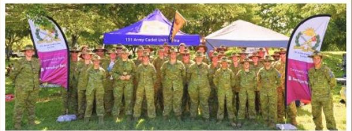
131ACU Cadets at the 2024 ADF Cadet Competition Day for Mackay & District, Queens Park.

SERVICE | COURAGE | RESPECT | INTEGRITY | EXCELLENCE