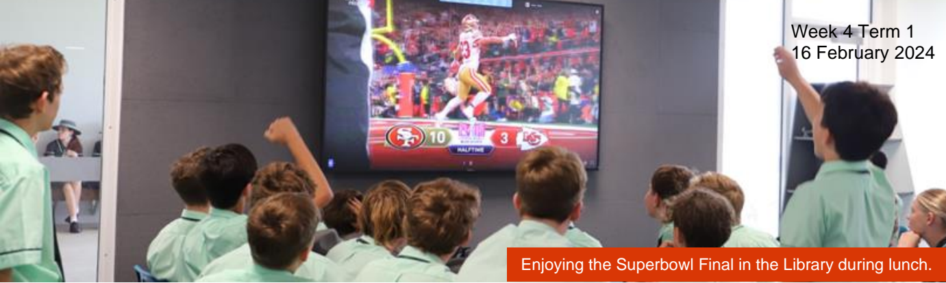
Enjoying the Superbowl Final in the Library during lunch.