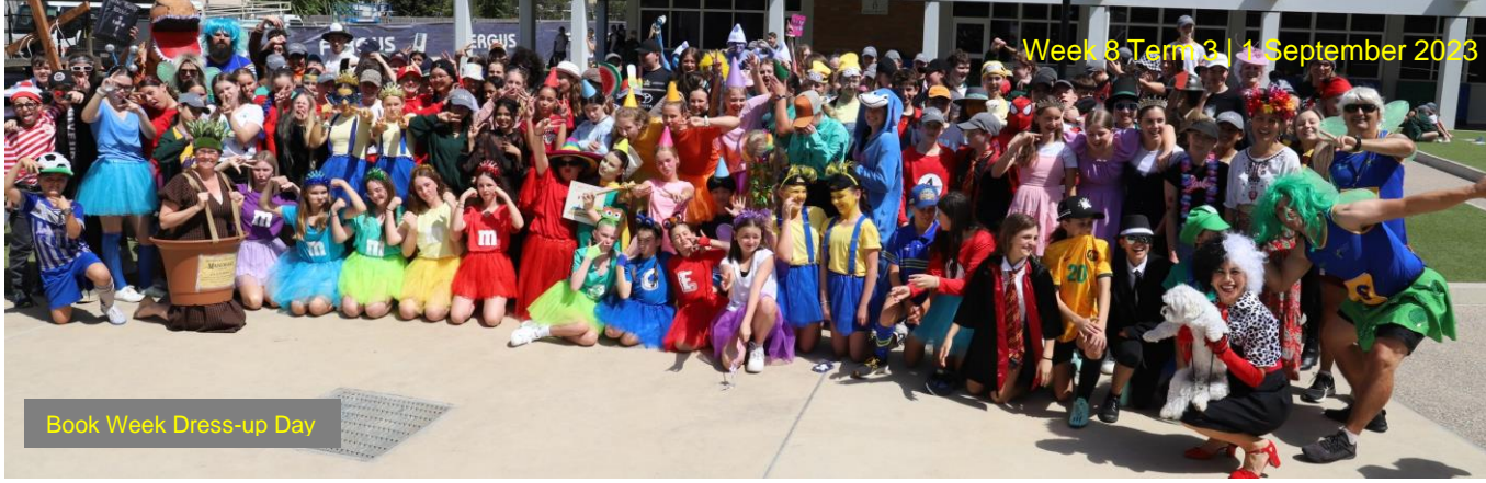
Book Week Dress-up Day